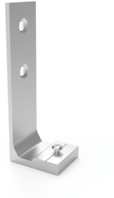
Item Code: FXN - 1121 - B - SM